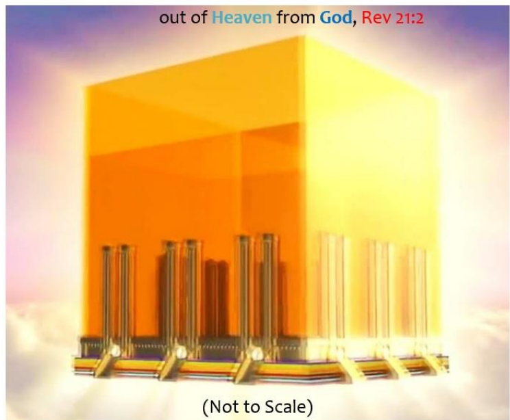
The Holy City, New Jerusalem coming down out of Heaven from God , Rev 21:2

the tabernacle of God is among men , Rev 21:3