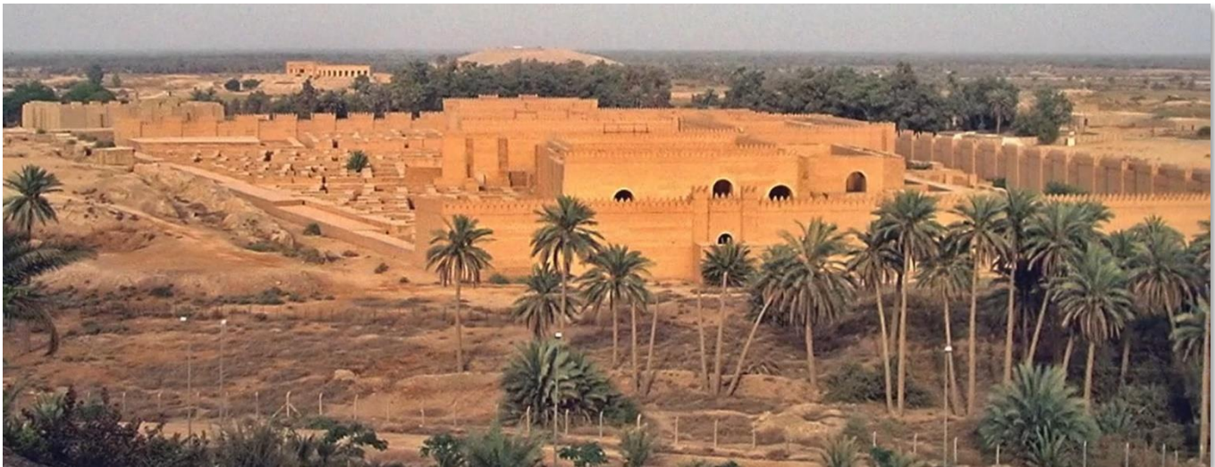
The rebuilt ruins of Babylon , 3 Charts

The destruction of the city of Babylon is the final blow to "the times of the Gentiles ", Luke 21:24 , which began when the Babylonian army attacked Jerusalem in 605 BC .