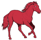
Red Horse to take Peace