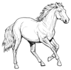
White Horse to Conquer