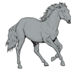
Ashen Horse Bring Death