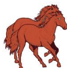
Sorrel Horses Patrol the Earth