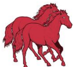
Red Horses Patrol the Earth

and behold, all the earth is peaceful and quiet." 1:11