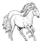
White Horses Patrol the Earth