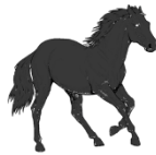
Black Horse Bring Famine