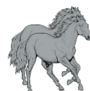
Dapple Horses (Septuagint Only) Patrol the Earth